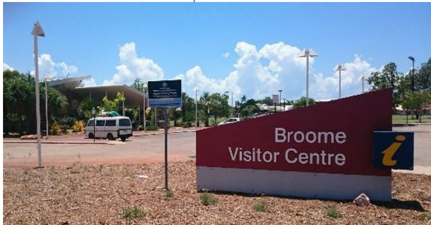
Major Regional Centre