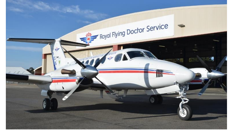
RFDS Fixed Wing